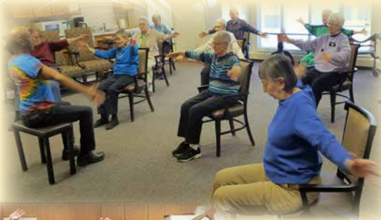
Towne Square and Parkside Residents Enjoying Yoga!

The benefits of yoga include improved strength and flexibility, improved mental clarity, improved pain management, stress reduction, improved balance and overall health. Residents from Towne Square Assisted Living and Parkside Independent Living Community are participating and enjoying these benefits.