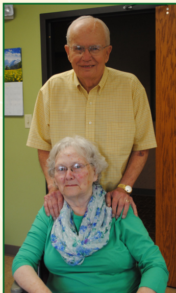
64 th Anniversary Celebration ~ 2015