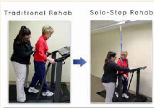
Benefits of Solo Step Therapy

The new Adult Day Health Center will be joining with five other successful existing programs on the same campus, so that all programs and participants will benefit from shared resources. If the need exists, an individual who receives services in this comprehensive continuum of care would be able to remain connected within the Bethesda organization and receive needed services. Given the Center's broad array of services, the project has significant potential to have tremendous impact on the quality of life experienced by the elderly residents of northeast South Dakota.