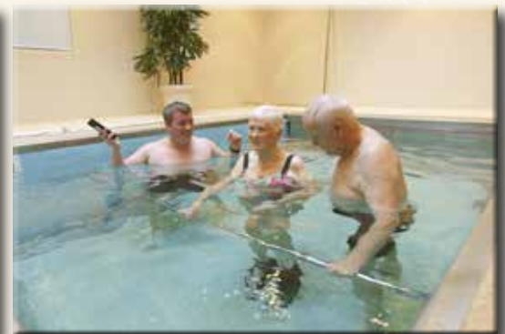
Bethesda's Warm Water Therapy Pool