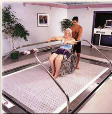
Wheel Chair and Walker Accessible Pool Deck