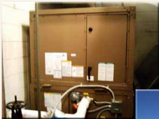
New Air Handlers at Bethesda

Thank you for your patience and support during our remodeling and construction. We are looking forward to these new, updated and beautiful spaces for our residents here at Bethesda Home.