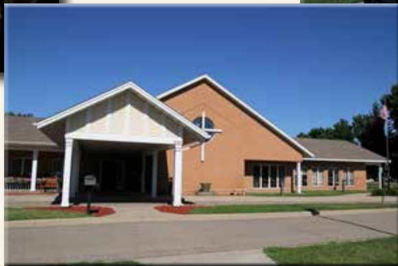
Bethesda Home of Aberdeen