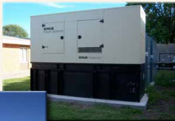
New Emergency Generator for the Bethesda Campus