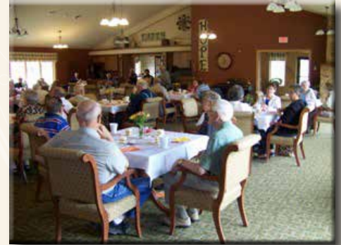
Bethesda's generous and giving volunteers, enjoying the appreciation event