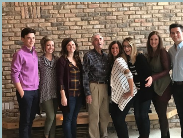
Awesome, loveable grandpa. The boys loved when he took them for tractor rides and the girls just loved visiting his farm.