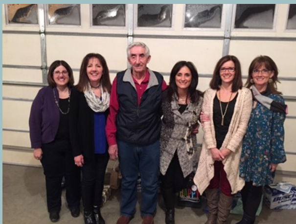
Loving, kind and very respectful father of 5 daughters. We sooo love our dad!!!