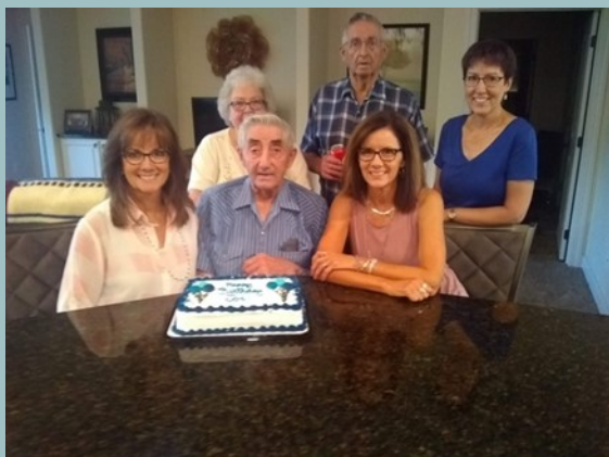
Celebrating his birthday with his brother, niece, good friend and 2 daughters.